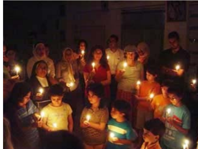
IDP – Amman, Jordan

URI Cooperation Circle members around the world enthusiastically celebrated the United Nations' International Day of Peace (IDP) in many diverse and creative ways.