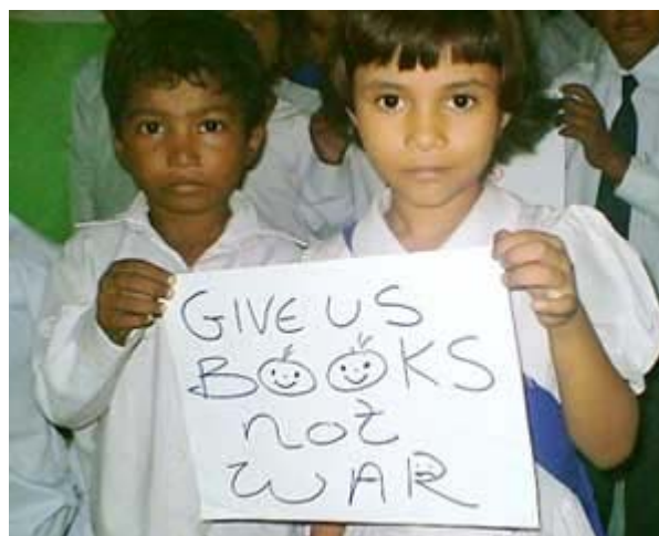
IDP – Warispora, Pakistan

Our story has chapters so far from Denmark, Finland, Pakistan, Jordan, USA, Argentina, Malaysia, The Philippines, Tajikistan, and India.