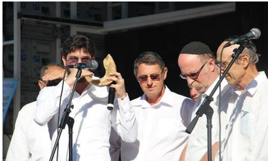
Prayers for the City hosted by Cape Town Interfaith Initiative January 2015

We see ourselves as peacebuilding partners. If we can't talk to each other, we are never going to be at peace. Talk, work, act: we must do these things together – that in itself is a peacebuilding exercise. That is our life's work. We have got to be prepared to be in for the long haul. It is not flippant. I have seen such amazing results and blessings.