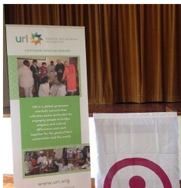
The picture on the URI Southern Africa Banner is of an historic CTII event in Cape Town

In Cape Town we have a lot more intrafaith conflict than interfaith conflict. Some of our partnerships are with groups who express their faith through the unconditional acceptance of others, such as the Brahma Kumaris. But inside the different faiths, those of orthodox or conservative tradition do not come to us, to interfaith events. I wish I could tell them how we draw parts of each experience to ourselves to enrich our lives. It does take a certain maturity within yourself to embrace people of other faiths. What many people don't realize is that their faith would grow so much more if they could embrace other people. It is false security to believe that yours is the only way. Our work is progressive. We just keep reaching out.