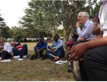
Prayers for the City hosted by Cape Town Interfaith, January 2015