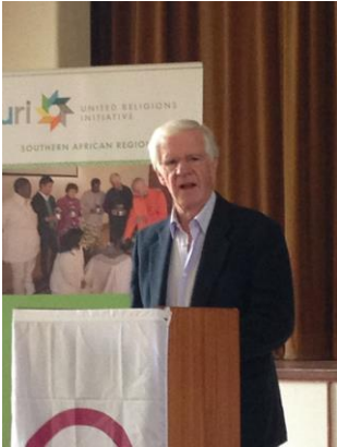
March 2015: Former Cape Town Mayor, Rev Gordon Oliver of CTII delivers the keynote address at the opening of the URI Southern Africa Regional Assembly