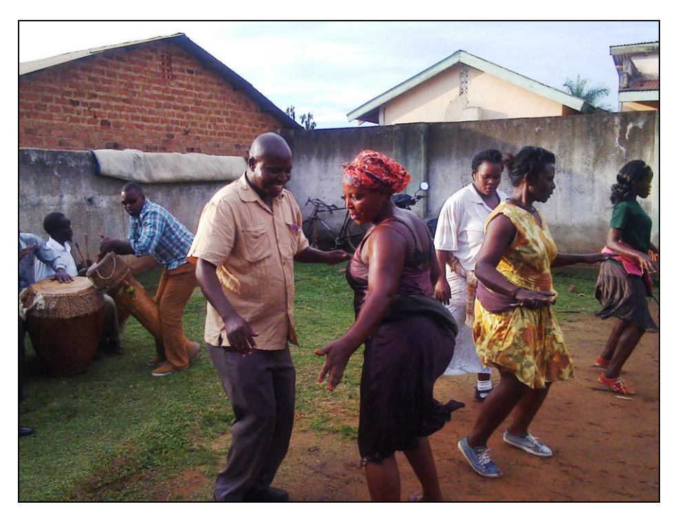
Top\ and\ Below,\ URI\ staff\ get\ to\ the\ stage\ to\ enjoy\ a\ traditional\ dance\ with\ Twe kolere\ CC\ members\ during\ in\ one\ of their rehearsals