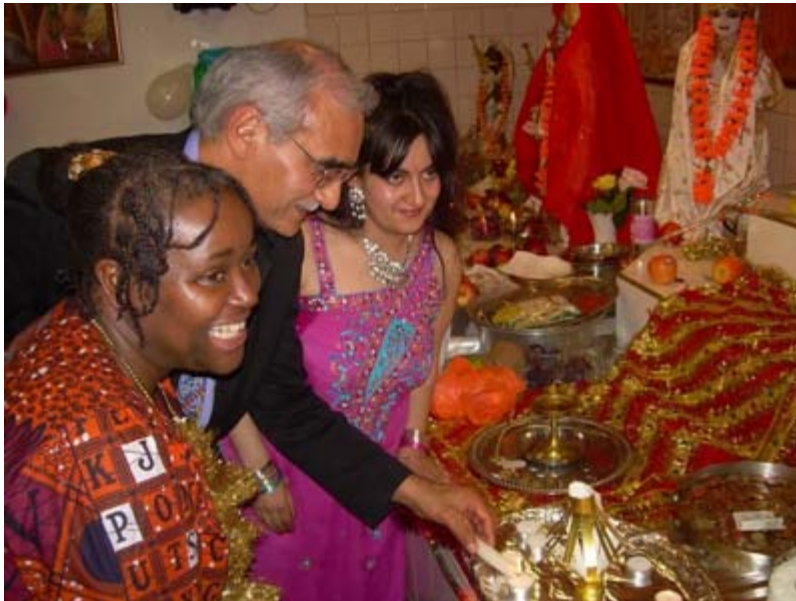
Faith 2 Faith CC in the U.K. celebrates Diwali

Diwali, the “festival of lights” is perhaps India’s most well known tradition, and one of the most important Hindu festivals. But Diwali, a five-day celebration of the triumph of good over evil, of light over darkness, is not just an Indian, or even a Hindu, holiday.