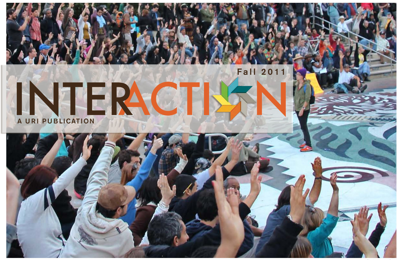
General assembly-style voting in Oakland, CA