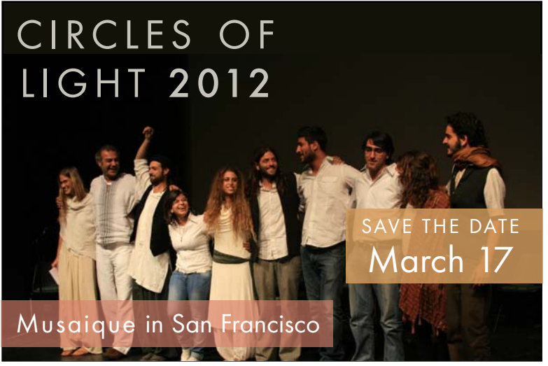
For sponsorship opportunities, visit www.uri.org