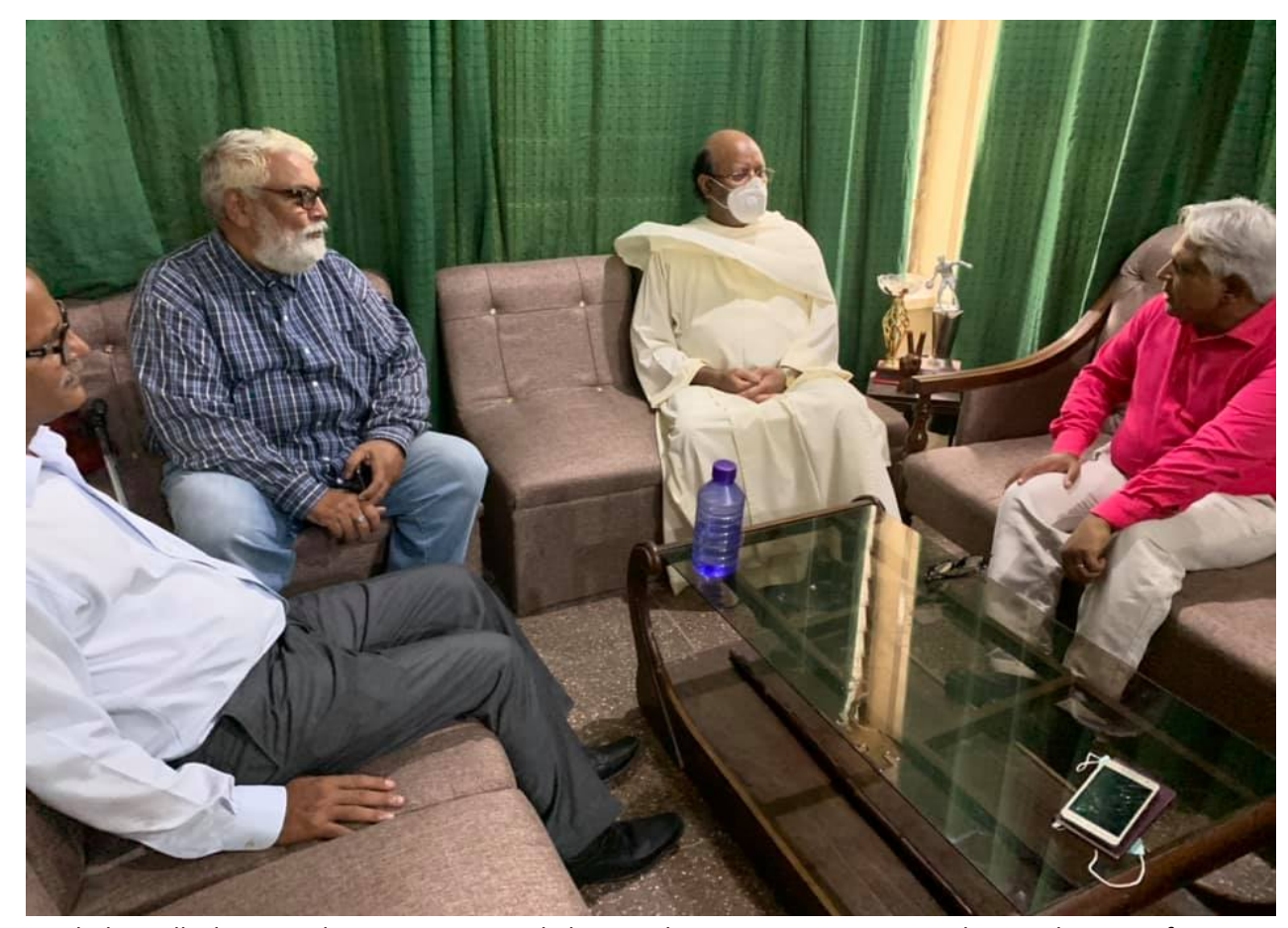
appealed to all Christian denominations and their authorities to visit UCH and gave donation for its renovations.

name of United Christen Hospital and we have to save it. He appreciated UCH Lovers and UCH Friends working for United Christian Hospital with this great deviation and commitment as Christians. He