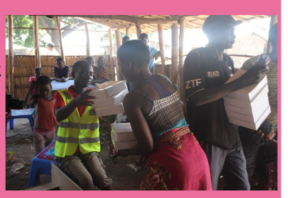
Pic: condoms distribution to the agents is in progress

protecting themselves from contracting STIs," said the chief.