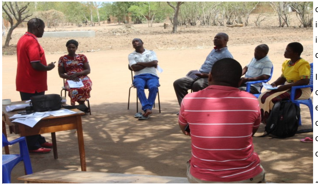
Pic: training session in progresss

eaders from different sectors in Phalombe district have been drilled on how they can deal with challenges which Adolescent Girls and Young Women (AGYW) are facing in the district.