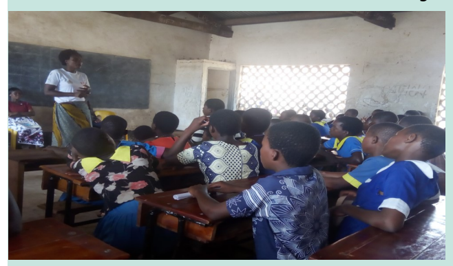
1. Edzi Toto club meeting in progress