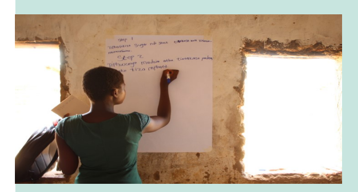
7 One of the participants during the baking training writing notes on the chart