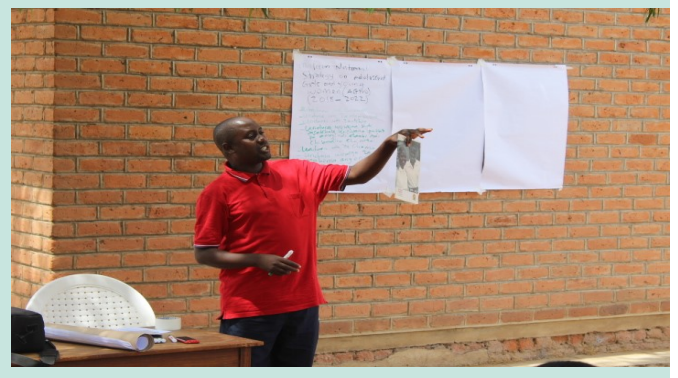
2. Muluzi facilitating a meeting