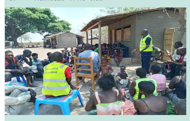
5 Community meeting at Njalo Island