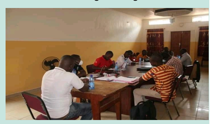
4. PYAO Annual Review meeting in progress