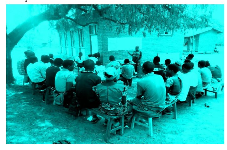
Pic: part of the training in the area of the T/A Chiwalo (the picture made unclear deliberately)

On the plea for the establishment of the youth clubs per group village head, Chidule said he will inform the office of the district youth officer and the district youth network chairperson.