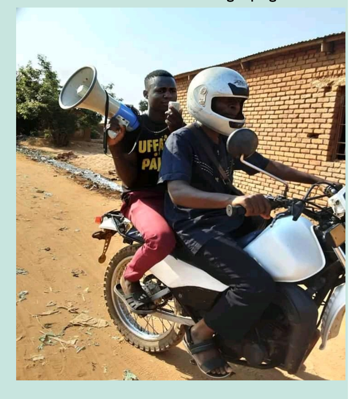
6 PYAO communications team moving around Phalombe sensitizing the communities about the COVID-19