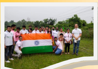
Observing Indian Independence Day