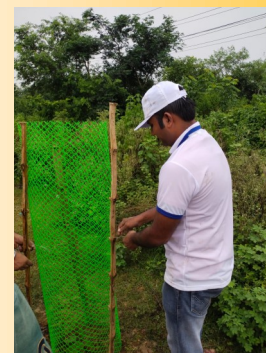
Fencing the plants to safe guards from Animals