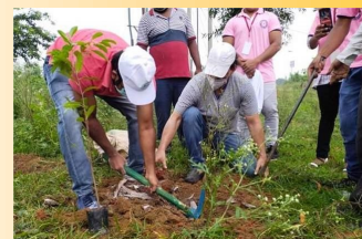
Members preparing the grounds for plantation

On 15th August commemorating Indian 75th Independence Day, the group planted 10 plants belong to the native species around Ghagorburi temple of Asansol with a responsibility to nurture till the plants grow to a safer height. W2W also distributed food to the homeless people around the temple.