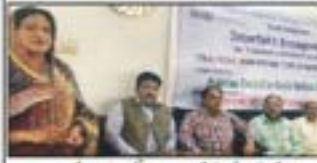
پشاور اور ملکی اخبار کی ترقی و ترقی... پشاور اور ملکی اخبار کی ترقی و ترقی...