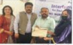
پشاور اور ملکی اخبار کی ترقی و ترقی... پشاور اور ملکی اخبار کی ترقی و ترقی...