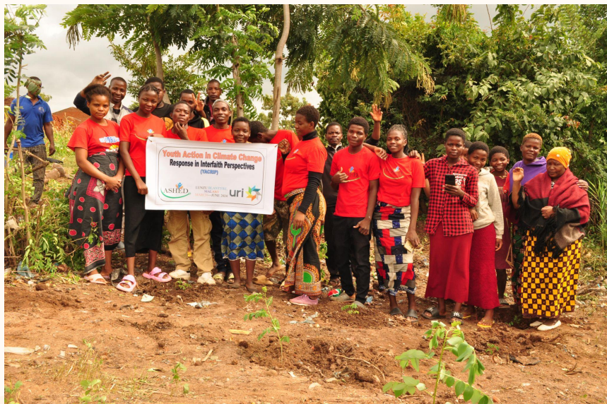
ASHED Team and Community Members at planting site