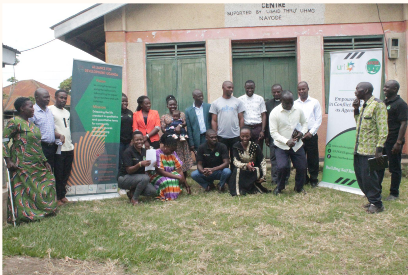
Project Launch with Community Stakeholders