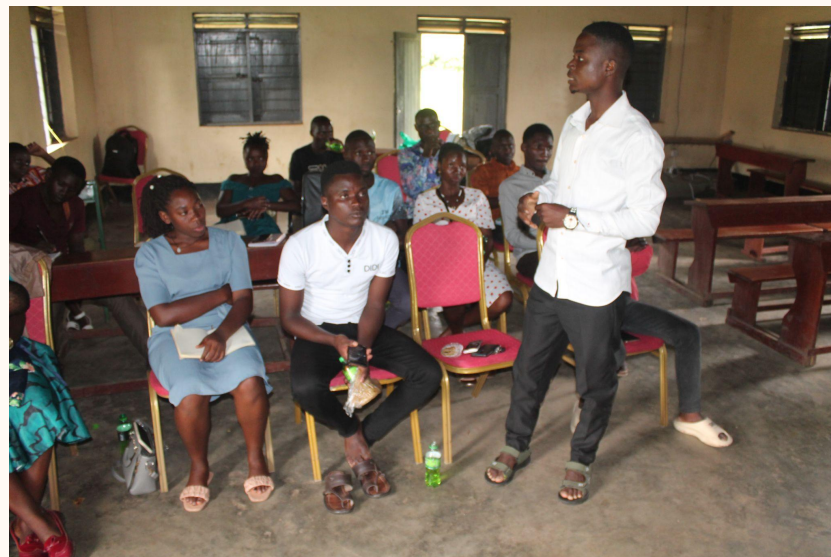
Training sessions with 25 selected youth