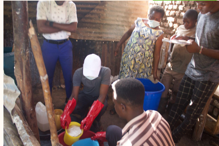
Soap Making Workshop