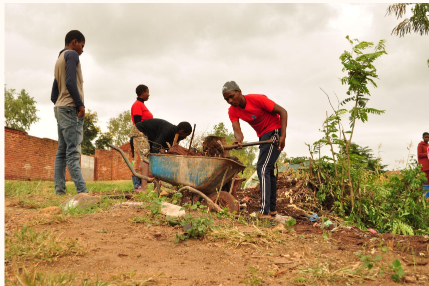
Site clean up and preparation