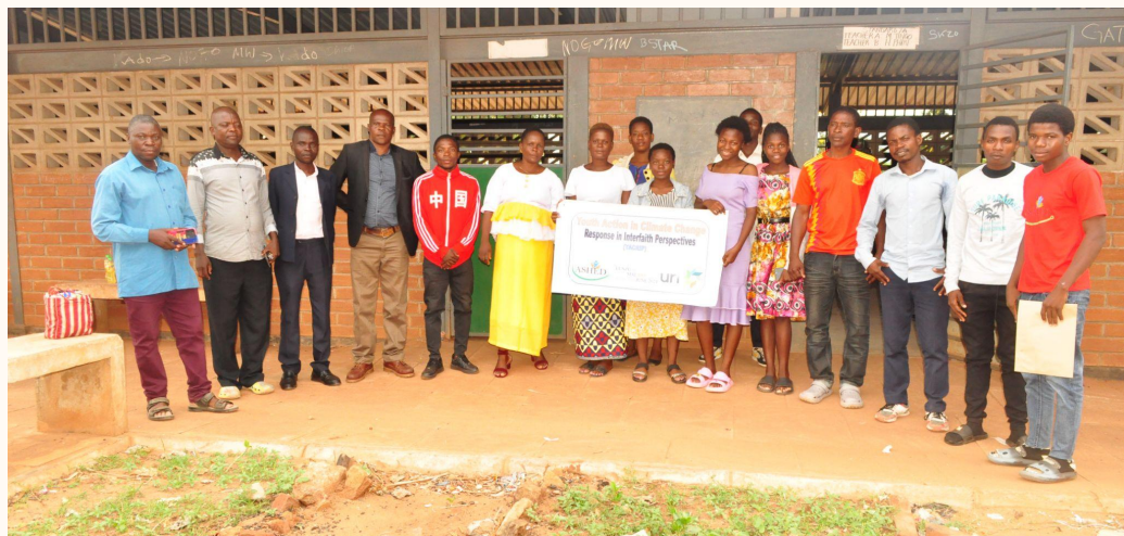
Interfaith Dialogue Meeting